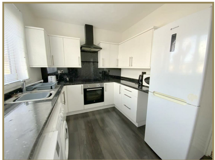
First Floor Flat, 243 Roberts Street, Grimsby, DN32 8DT £57,000